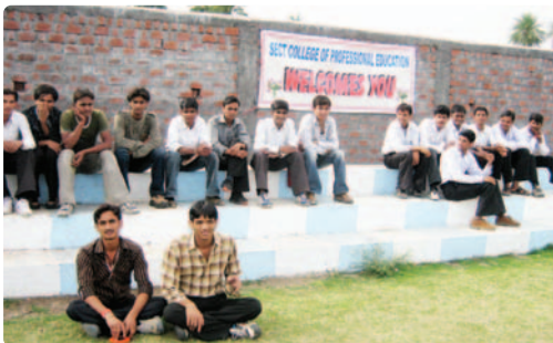
Watching sports in SCOPE