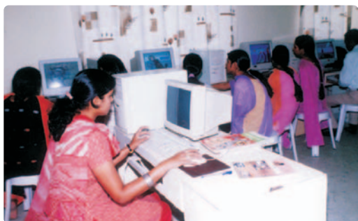
Students in Computer Lab