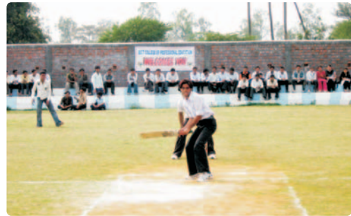
Annual Sports in progress