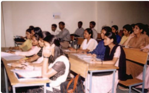
Student in SCOPE College

The SCOPE Public School was established in 2001 and is affiliated to M.P. Board of Secondary Education. It offers classes from Class-I to Class-XII in physics, Chemistry, Maths, Bio and Commerce groups, in both English and Hindi medium. The school has a high rating among various schools in the city.