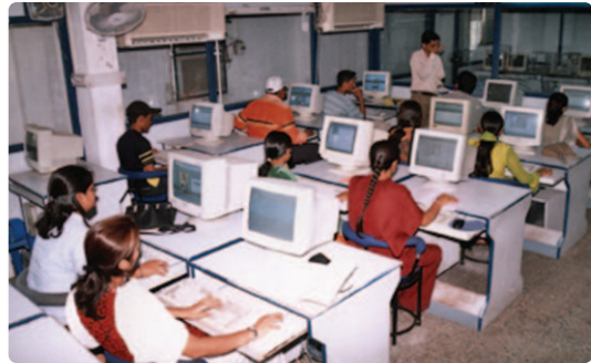
Students in the I. T. and Management Centre