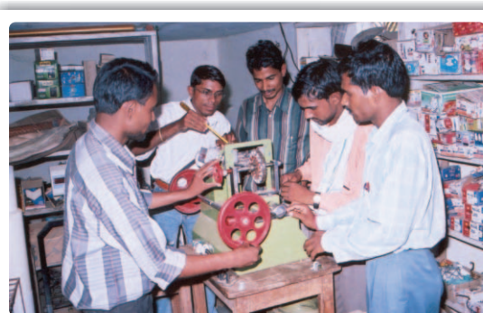
Students in the I. T. and Management Centre