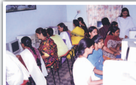
A. T. Tamil Nadu