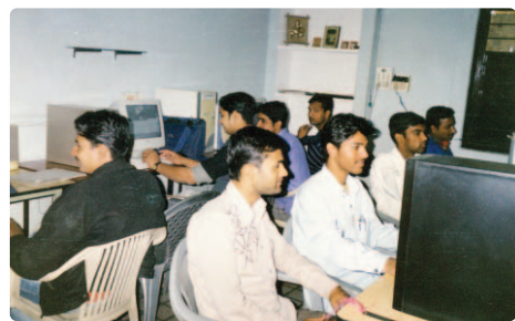
A. T. Tamil Nadu