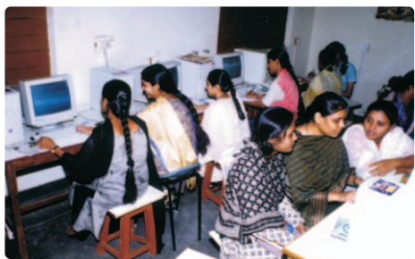
An I. T. Training Centre