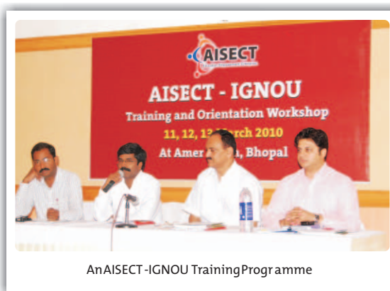
An AISECT-IGNOU Training Programme