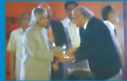
NASSCOM I.T. Innovation Award