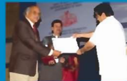
National e-Governance Award.