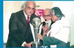
Indian Innovation Award