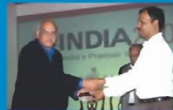
Asian Forum I4d Award